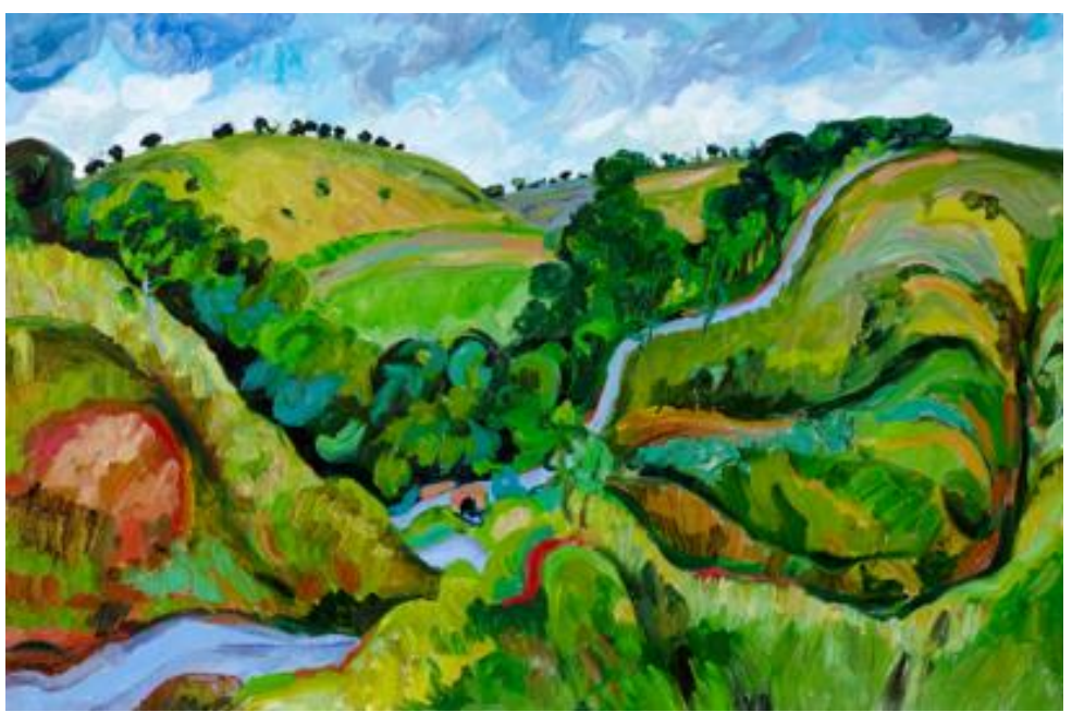
Josephine Trotter, Blue Road across Exmoor , oil on canvas, 24 x 36 in. ( 60 x 90 cm)

17 CLIFFORD STREET, LONDON W1S 3RQ Tel: 020 7437 6010 art@omniaart.com www.omniaart.com