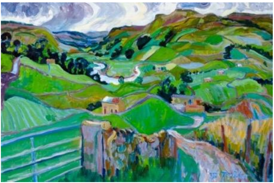
Josephine Trotter, River Ure, Wensleydale , oil on canvas, 24 x 36 in. (60 x 90 cm)

17 CLIFFORD STREET, LONDON W1S 3RQ Tel: 020 7437 6010 art@omniaart.com www.omniaart.com