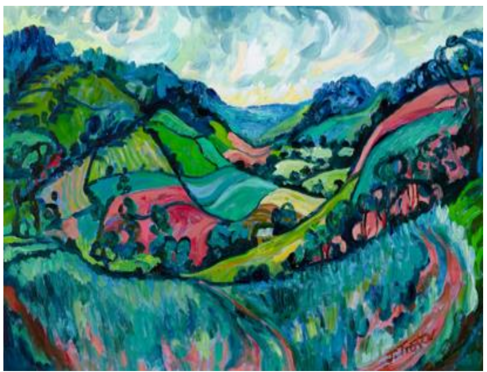
Josephine Trotter, Stogumber, Somerset, oil on canvas, 24 x 36 in. (61 x 91 cm)

Omnia Art is delighted to announce a new exhibition of Josephine Trotter's paintings at Gallery 8, St James's, London. Trotter's 26<sup>th</sup> solo exhibition will feature 40 paintings with a particular focus on the large-scale landscapes for which she is best known, all painted en plein air at a single sitting and completed in 2023 and 2024.