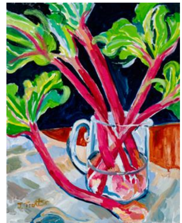
Josephine Trotter, Rhubarb in a Glass Jug , oil on canvas, 20 x 16 in.(50 x 40 cm) Image courtesy the artist © Justin Piperger