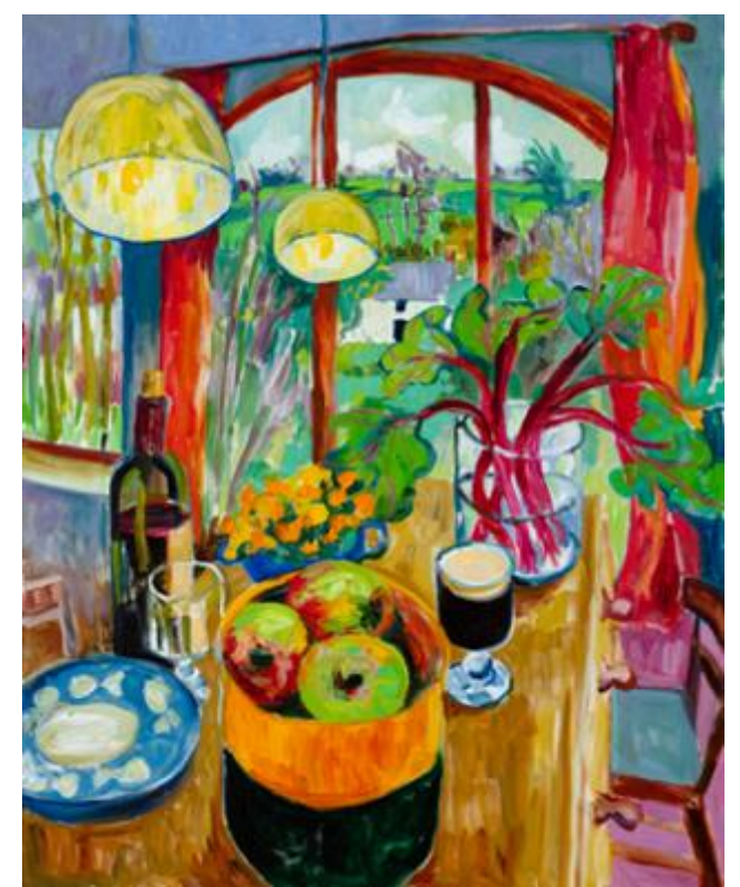
Josephine Trotter, Interior with Guinness , oil on canvas, 30 x 24 in. (76 x 61 cm)